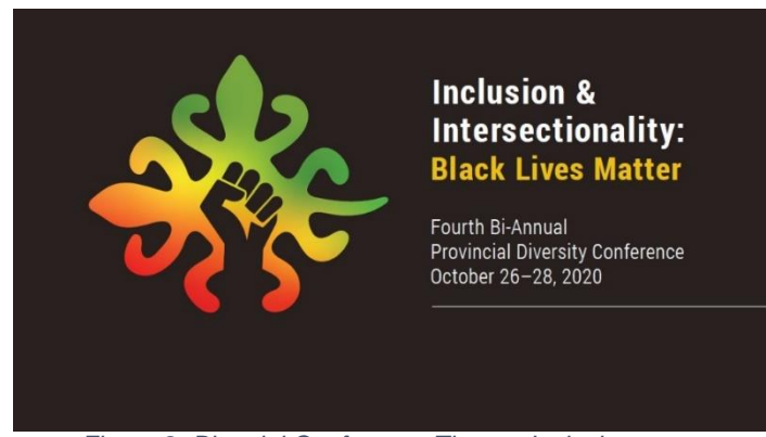
Figure 2: Biennial Conference Theme: Inclusion and Intersectionality: Black Lives Matter